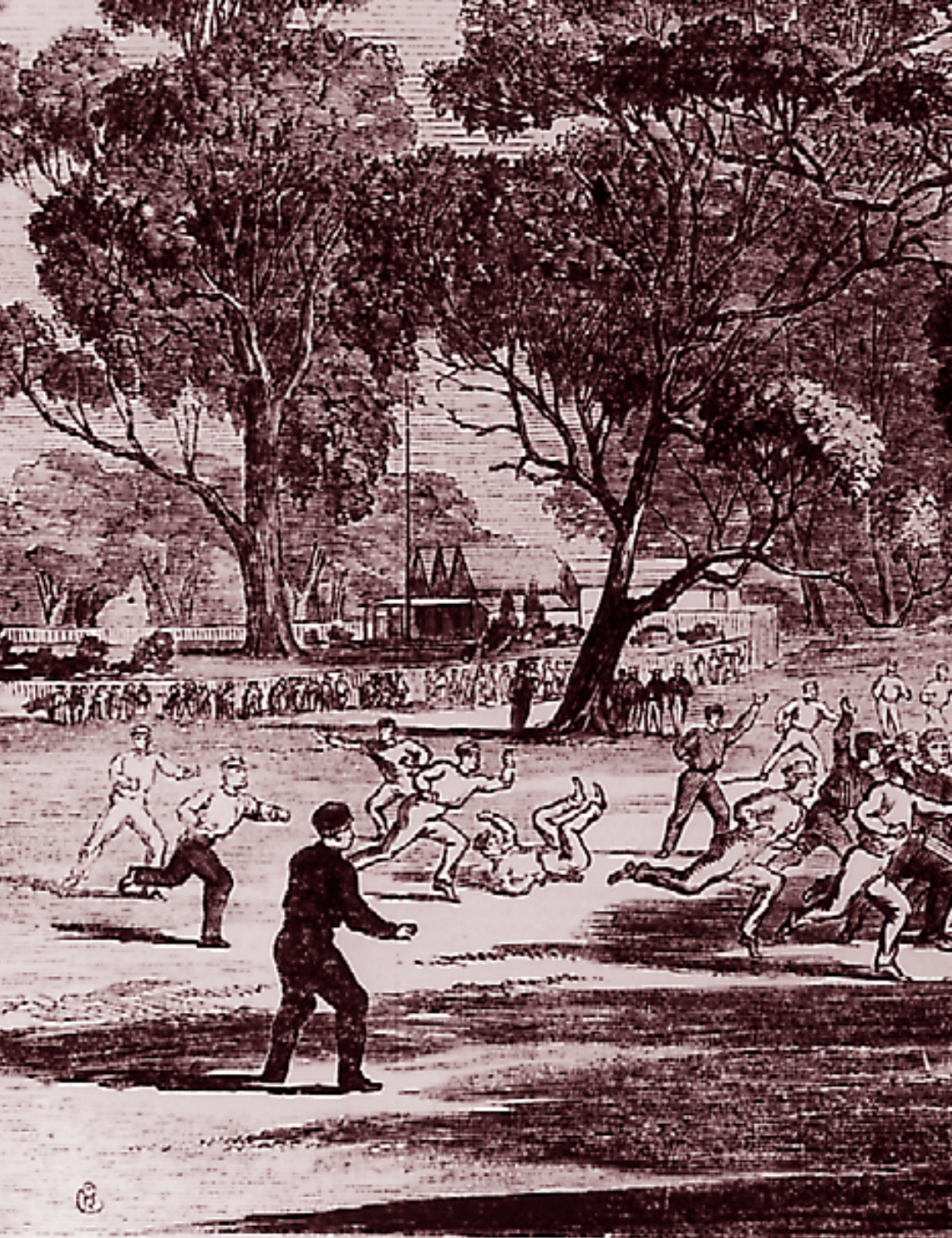
Yarra Park and the Melbourne