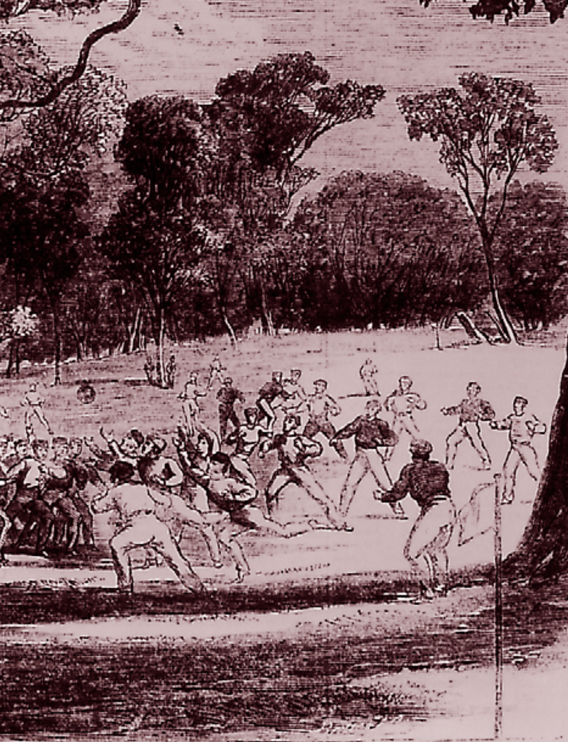
Cricket Ground in 1886