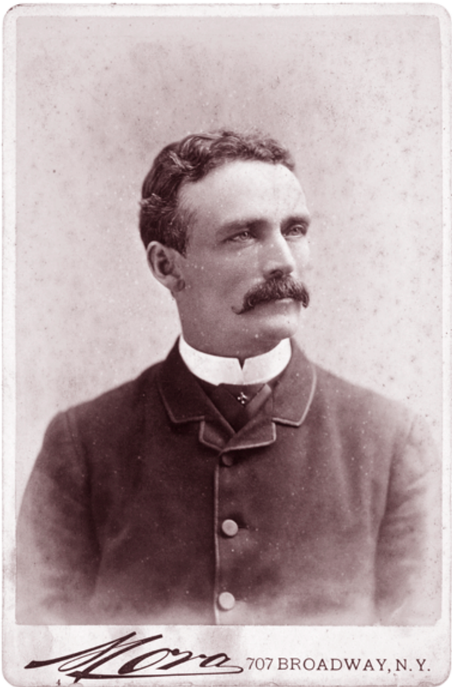
Henry Colden Antill Harrison The outstanding athlete of his time, Harrison was football's leading player untill his retirement in 1871. this portrait was taken in New York, c.1885.