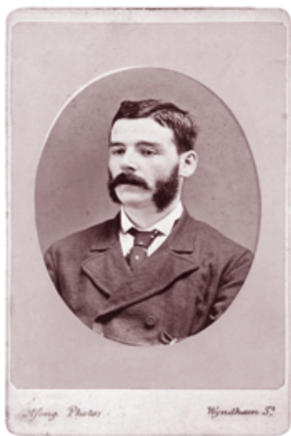
Benjamin Goldsmith A portrait of the former Melbourne captain, around the time of his 1875 departure for China.