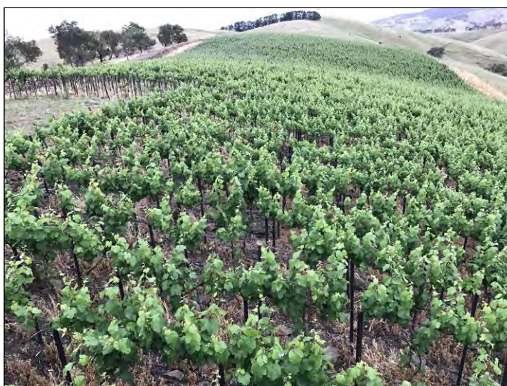
Figure 10: Old Vine Riesling at Steingarten