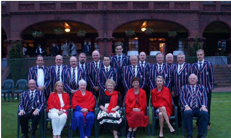
Figure 21: The Touring Party at the Tournament Dinner at Merion CC