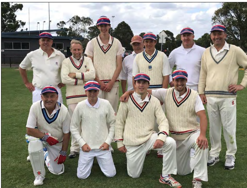
Figure 14 Good to See Some Youth in The Squad