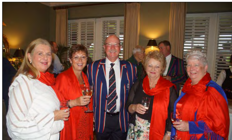
Figure 22: Chairman with His Harem at Merion CC