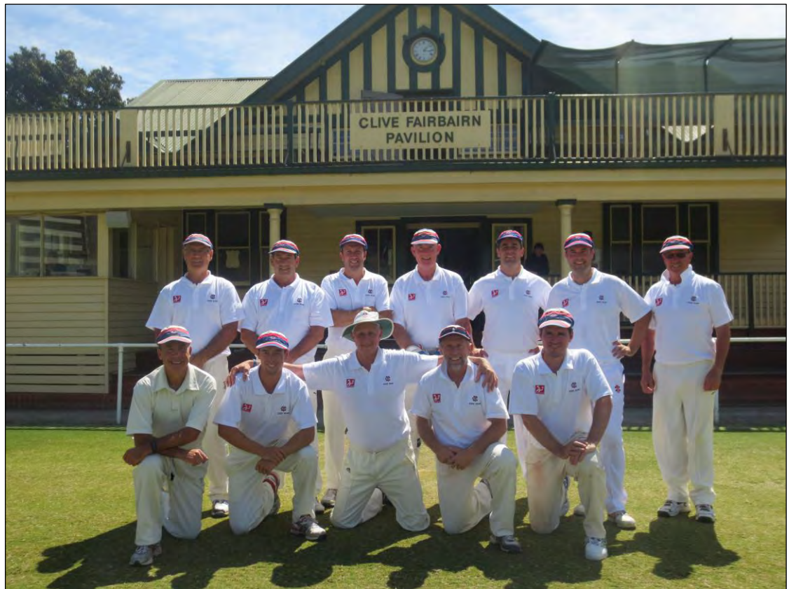
Figure 17: Who is the odd man out in the floppy hat?