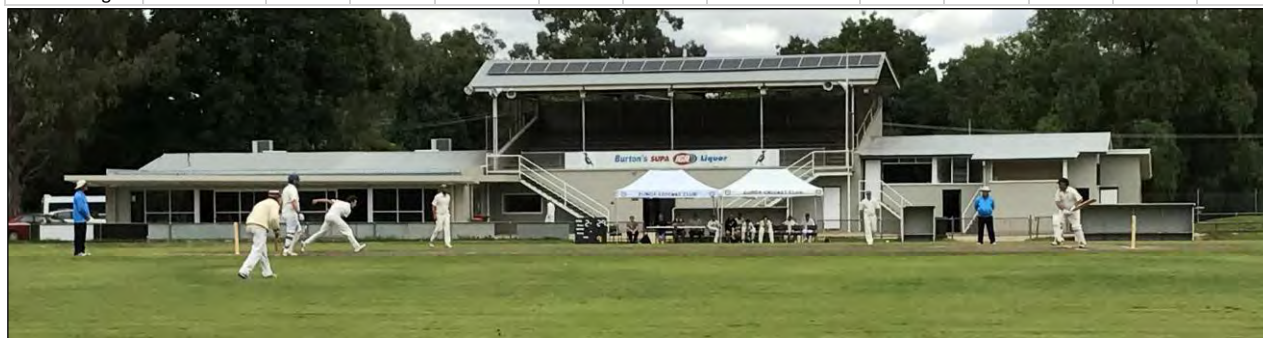
Figure 15: Picture Perfect at Euroa CC

Sunday morning at the Albert. Geoff Fidler has the bus warmed up and we head off up the Hume for one of the great cricket fixtures. Up to play against (Euroa) Milly's mob. You feel it as you head into Kelly Country! By that I mean the hospitality and warm greetings.