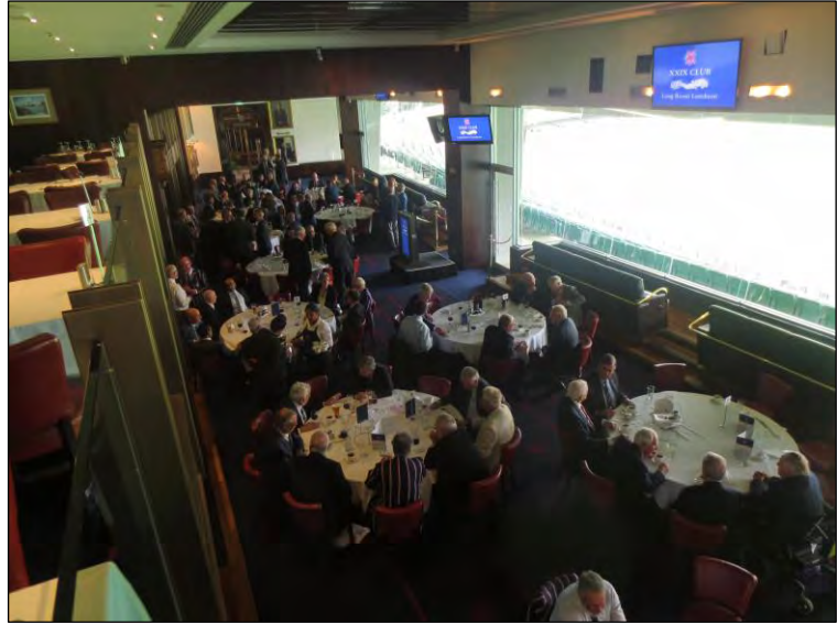
Figure 2: LRL Best Value At The "G"

Just under 200 Members and Guests attended our Annual Dinner in the MCC Dining Room to hear from one of the best after dinner speakers; Australian Test Cricketer, Greg Ritchie. Our numbers were down by 20% on the previous year, which indicated that a Saturday night at the end of the Melbourne Cup Carnival caused a number of other function clashes. Your committee has been diligently working on attempting to find the best night of the week in November for this function, and this year we have selected a Wednesday evening to avoid any clashes. This function resulted in a small loss.