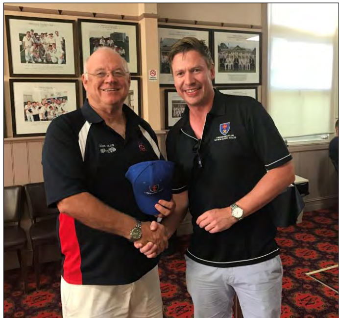
Figure 13: NSW Recognition for Our Illustrious Team Manager