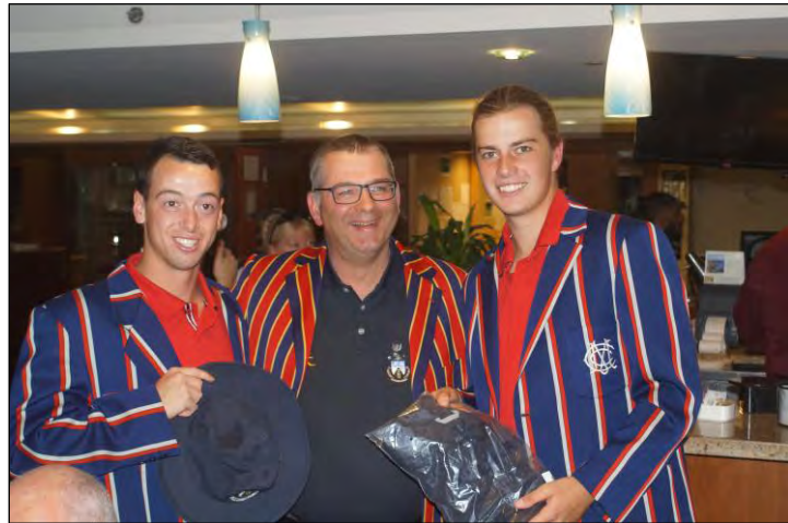
Figure 27: Toronto Awards

Thank you TCSCC for your hospitality and 'new' friendship.