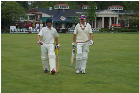
Figure 31: Openers @ Philadelphia CC