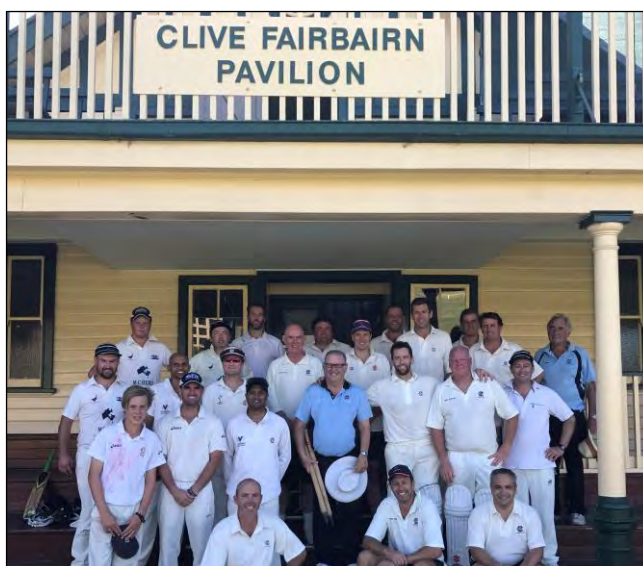
Figure 18: Slats Trying to Steal The Stumps Again

The Club XI won the toss electing to bat first. Most of their top order got some runs without getting away from the XXIX Club side, who (apart from one dolly dropped by the usually safe hands of Tim Fidler) fielded well and bowled very tightly. Pick of the bowlers were Tim Fidler (2/33), John Fitzgibbon (2/37) and also Ryan Fort (1/16 off 8). The end total of 5/184 off 38 overs was a competitive one for the home team to chase.