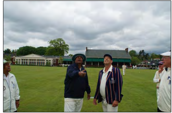
Figure 30: Toss for the Travellers Cup Game