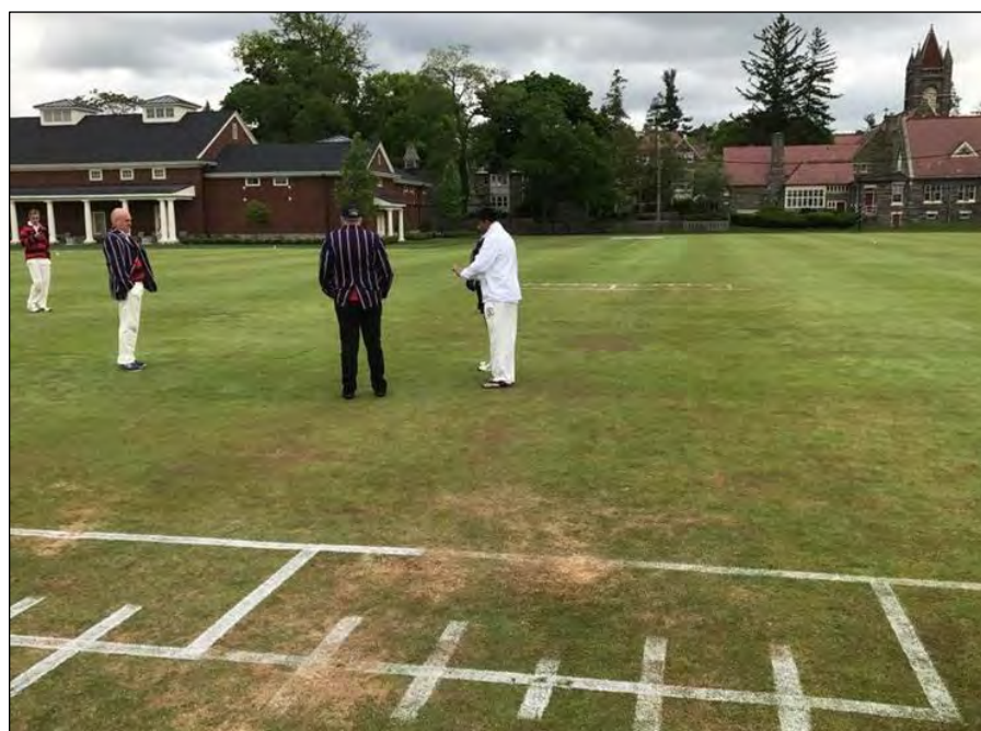
Figure 20: There is a Pitch Here Somewhere