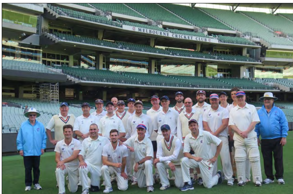
Figure 7 Warriors of the MCG