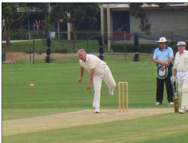
Figure 11: Rats Reported for Grunting