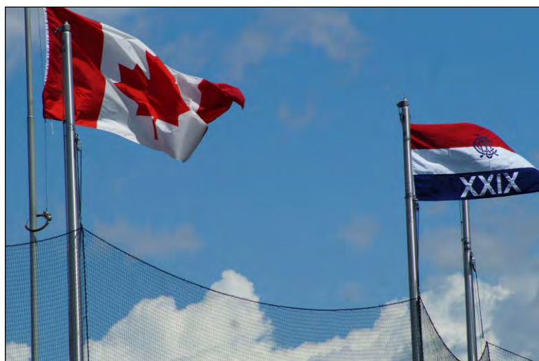
Figure 26: We Didn't Win, But We Flew the Flag

As it turned out, the XXIX Club went down in the second last over in the inaugural MCC v TCSCC sporting contest. Asked to bat first, the XXIXers compiled 7/146 off 40 overs on a slow but flat and even turf pitch, on a slowish outfield - all understandable in this early part of their season.