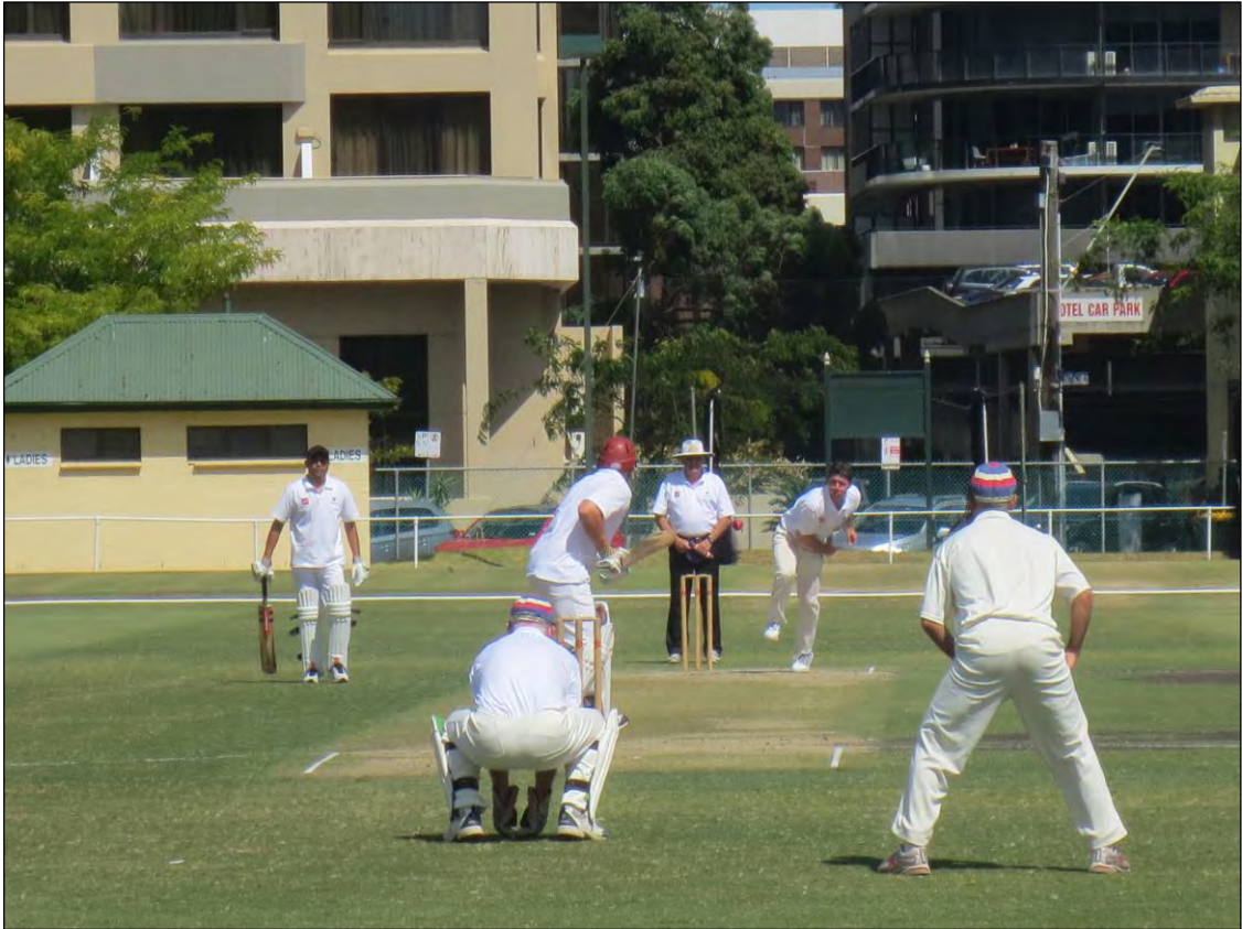
Figure 16: First Slip says "I hope he doesn't nick it"