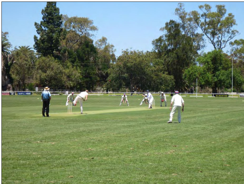
Figure 8: Rats wants to Bottle this Green Top