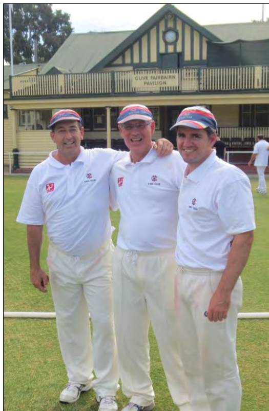
Figure 5: The only three MCC 300 gamers Now Turn Out For XXIX Fixtures