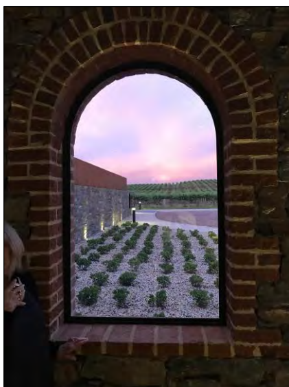
Figure 9: Sunset at St Hugo's