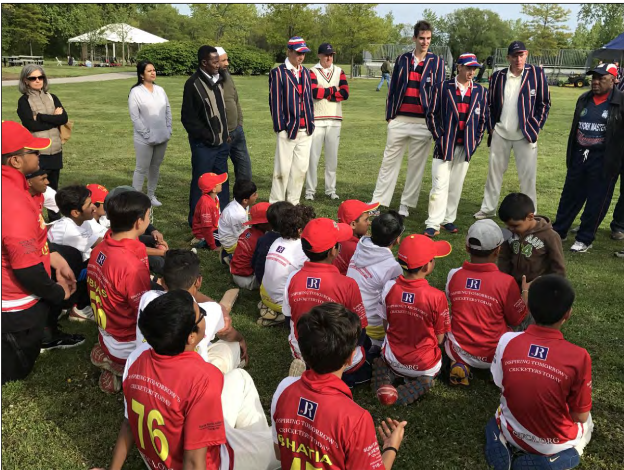
Figure 25: Coaching Session at Queens Academy

At 5.00 pm all the local kids came for a nets session with the elite Aussie players. Lots of talent and enthusiasm on display from both the kids and the make-shift coaches. The hospitality of the locals was outstanding. Chicken and rice needs to get some support as an afternoon tea option in