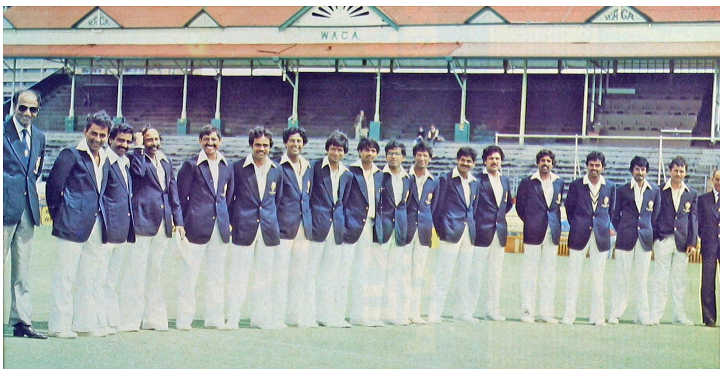
1980/81 Indian team for the first match of their tour at the WACA, Perth on November 22, 1980

It began on 23 November, with Australia, India and NZ playing 10 matches apiece, the two leading sides then playing off in a best-of-five finals series commencing at the end of January. As India won only three of its preliminary games it failed to qualify. Apart from the Tests and ODIs, the tourists also played first-class matches against five of the six Australian states and a number of minor one-day contests. Following their long programme in Australia, the Indians subsequently travelled to NZ where they played a further two ODIs and three Tests.