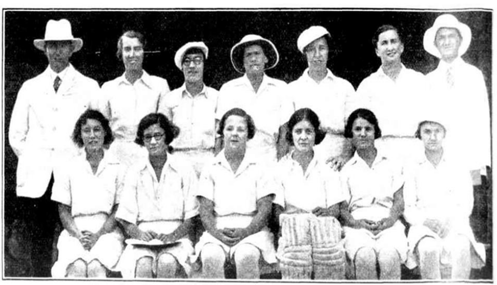
The Australian Test Team for the Third Test, taken before play began on Friday