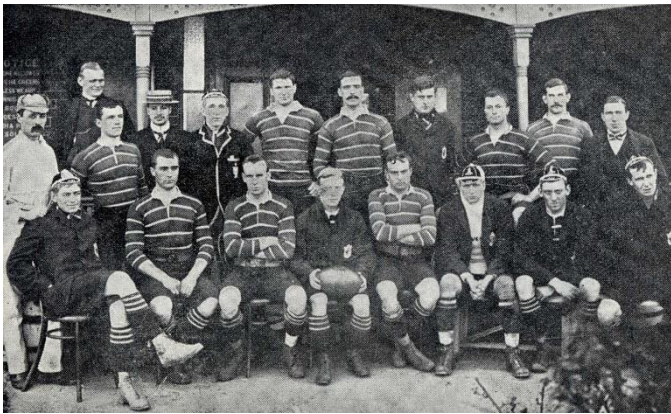
British Isles Rugby Football Team