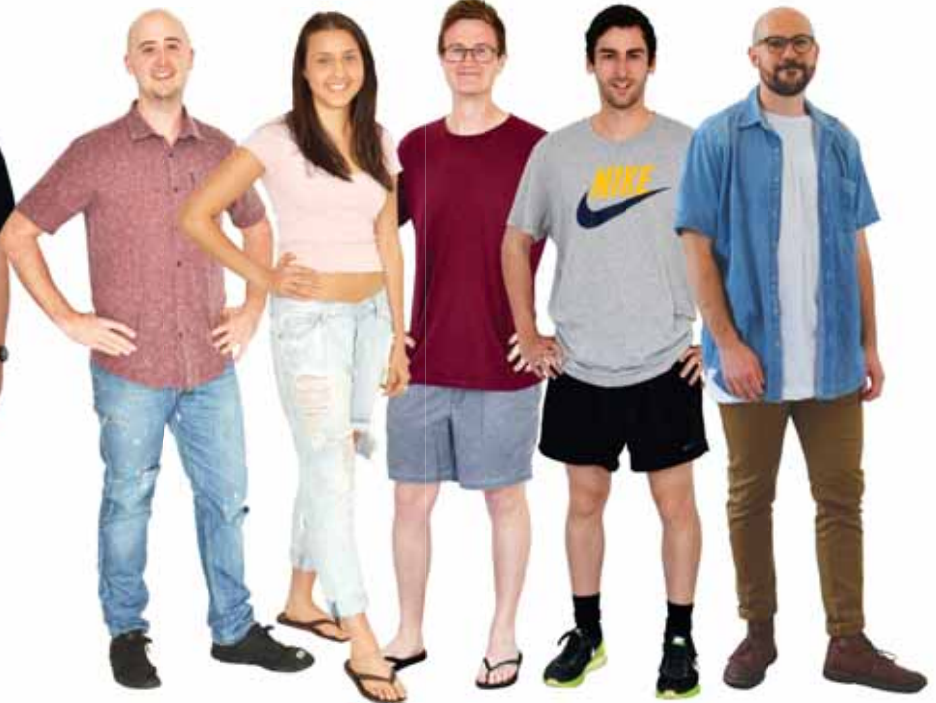
Torn jeans, dilapidated footwear