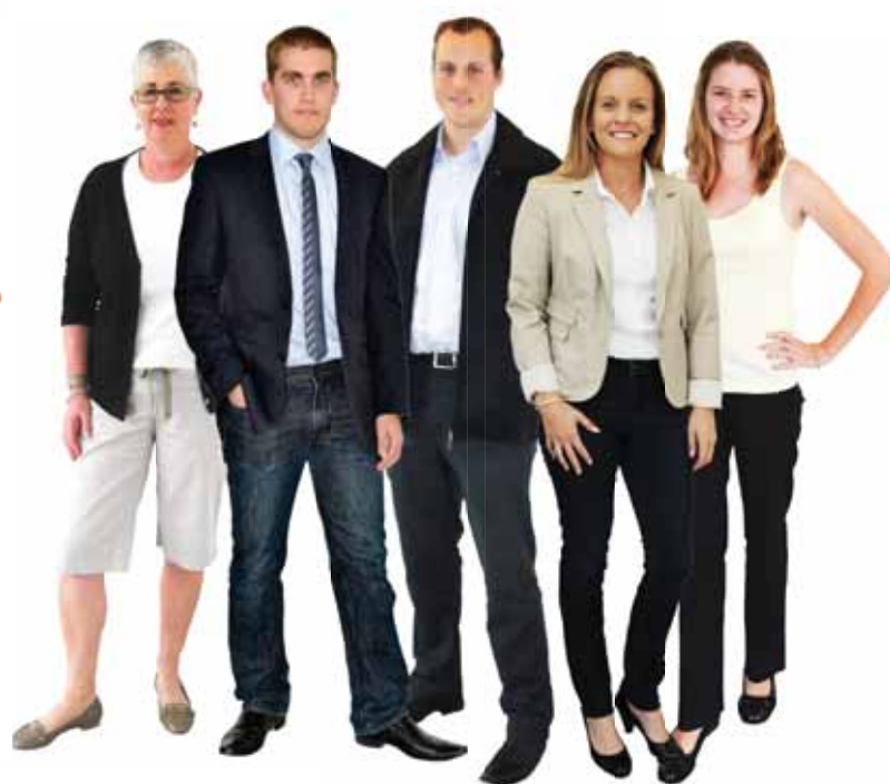
Non-tailored casual pants