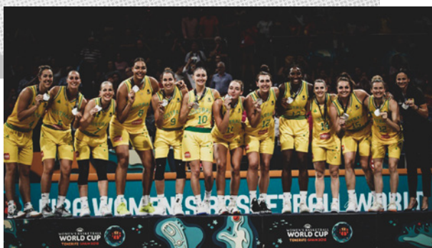
MCC member Rebecca Allen in action for the Australian Opals basketball team (right) and New York Liberty (top). CENTRE: Allen (fifth from left) was part of the silver medal winning Australian team at the 2018 FIBA Women's Basketball World Cup.

As an interesting aside, Allen went to Carey Baptist Grammar and was a classmate of the current Australian women's cricket captain, Meg Lanning, another young star doing great things on the world sporting stage.